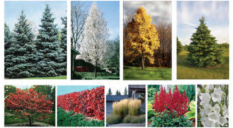
Plant Material Samples