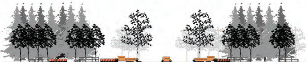
Gateway Feature Section